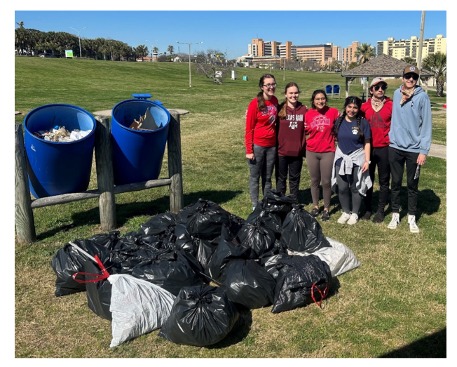
Students in Corpus helped clean Cole Park on the bayfront.

Commerce's National Oceanic and Atmospheric Administration, Valero, the Texas Coastal Management Program, Great Lakes Dredge & Dock, Flint Hills Resources, Gulf Copper, Cheniere, Ocean Conservancy, Altos Planos Mijenta Tequila, and ATX Solar.